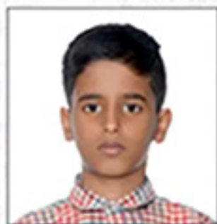
Sri Rama Krishna