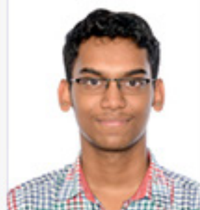
Sidharth Govt. Medical College, Siddipet