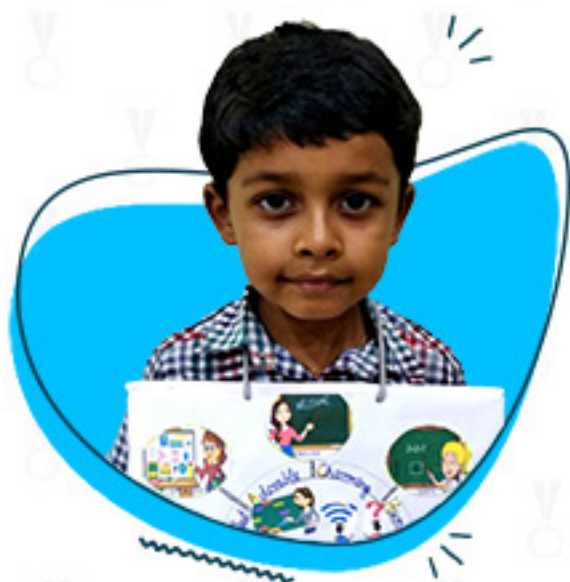
Tanveer Sahoo ( class - II )

Several Prizes were bagged by Vikasians in competitions conducted at Vista School held in September, 2020