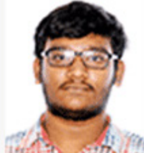
Abhinav Prabhu Govt. Medical College, Warangal