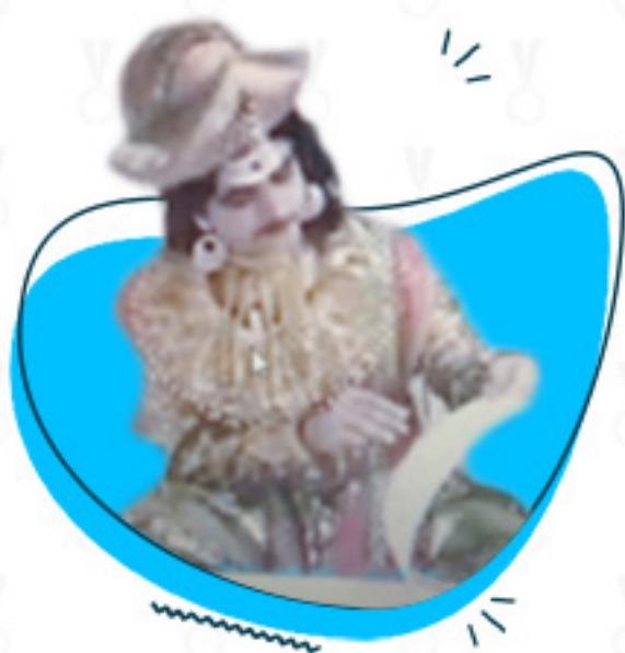
Aryan Papetla ( class - XI )